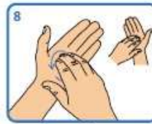
8 Rub tips of fingers in opposite palm in a circular motion