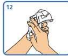
12 Dry thoroughly with a single-use towel