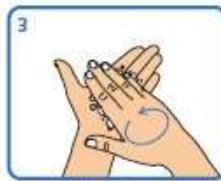
3 Rub hands palm to palm