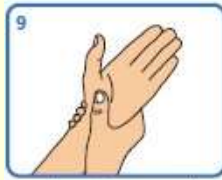
9 Rub each wrist with opposite hand