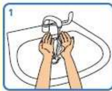
1 Wet hands with water