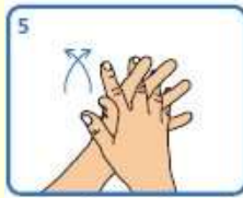
5 Rub palm to palm with fingers interlaced