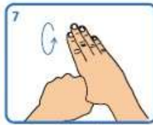
7 Rub each thumb clasped in opposite hand using a rotational movement