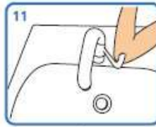
11 Use elbow to turn off tap