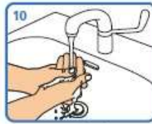
10 Rinse hands with water