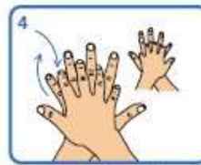
4 Rub back of each hand with palm of other hand with fingers interlaced